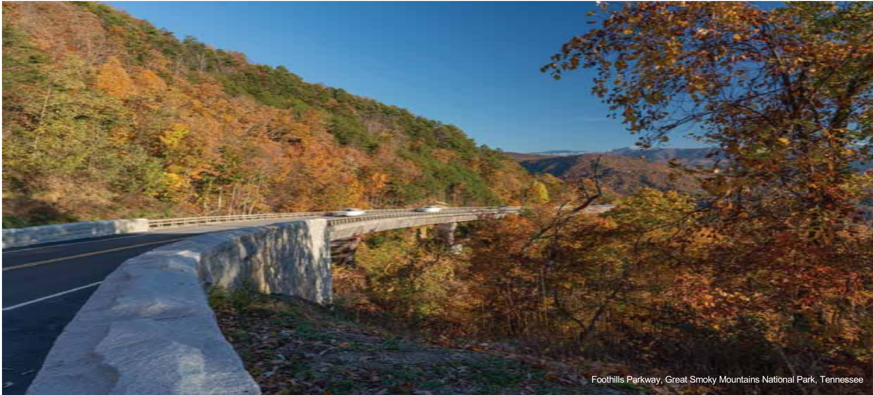
Foothills Parkway, Great Smoky Mountains National Park, Tennessee