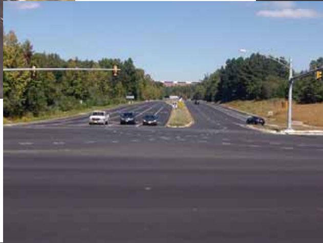
Route 1, Fairfax County Parkway, Virginia