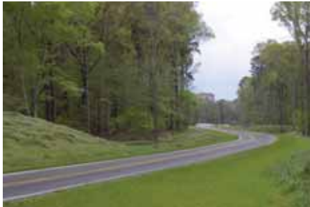
Natchez Trace Parkway, Tennessee