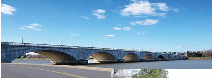
Arlington Memorial Bridge, DC/Virginia