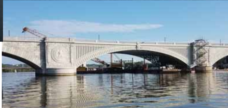
Arlington Memorial Bridge, VA/DC Before/After