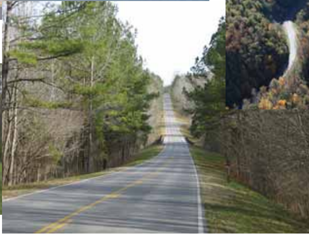
Foothills Parkway, Tennessee