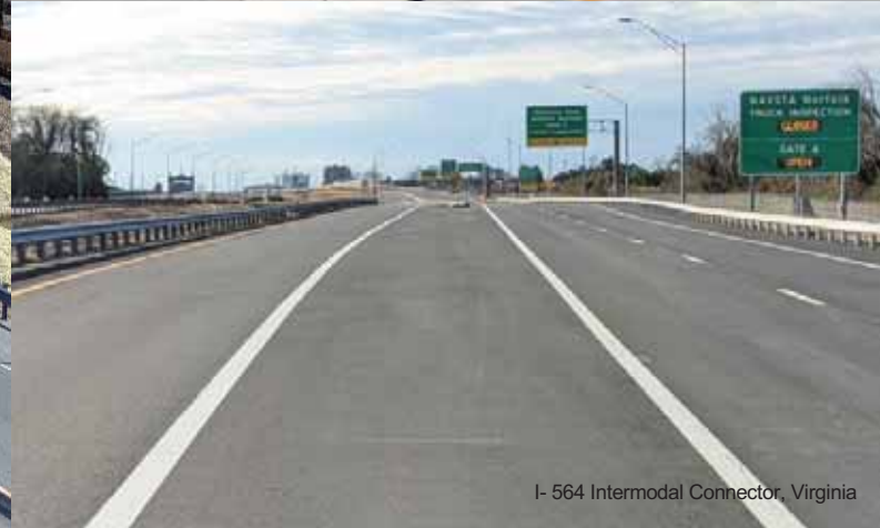
I- 564 Intermodal Connector, Virginia