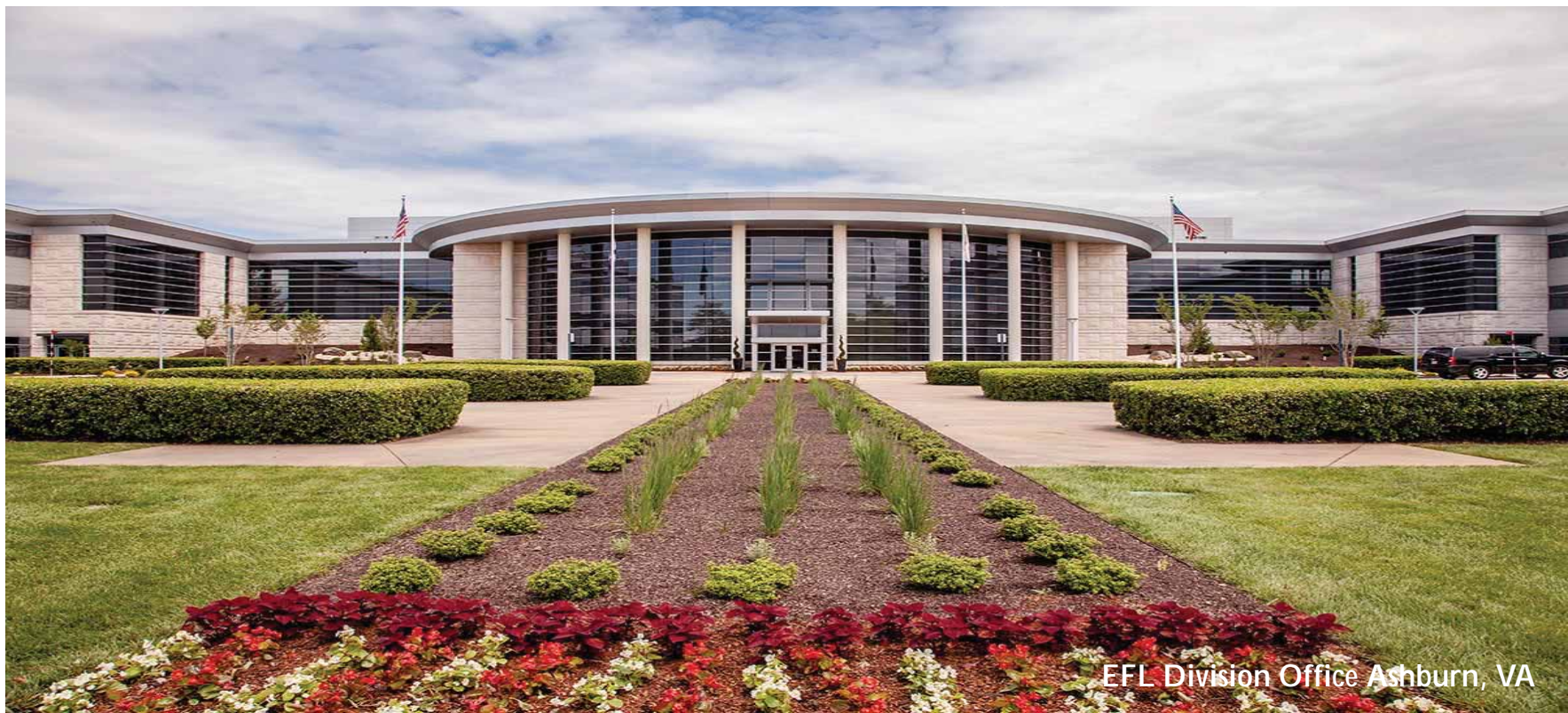
EFL Division Office Ashburn, VA