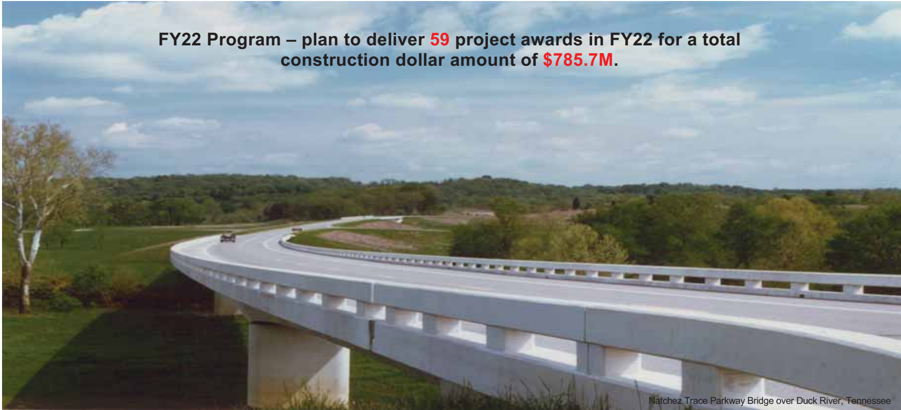
Natchez Trace Parkway Bridge over Duck River, Tennessee

FY22 Program – plan to deliver 59 project awards in FY22 for a total construction dollar amount of $785.7M .